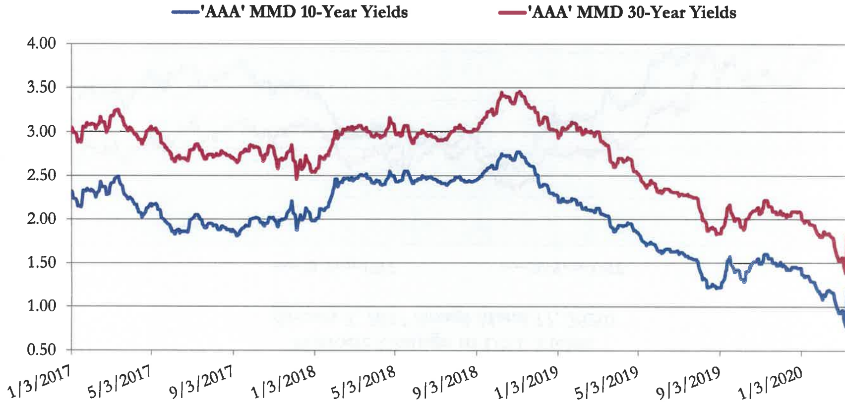
Historic Change in 'AAA' MMD Yields (January 3, 2017 through March 11, 2020)